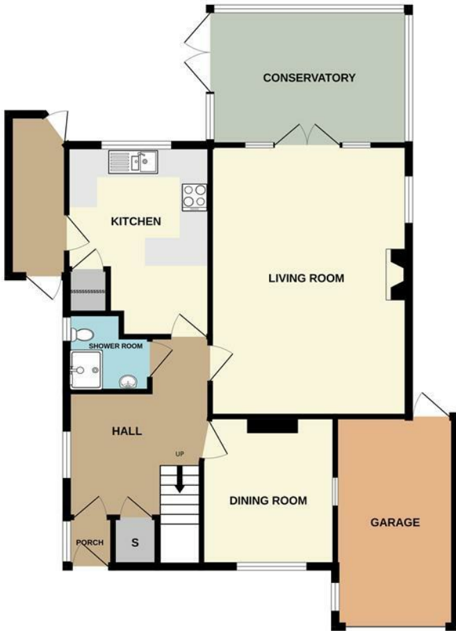
Ground Floor 967 sq.ft. (89.8 sq.m.) approx.